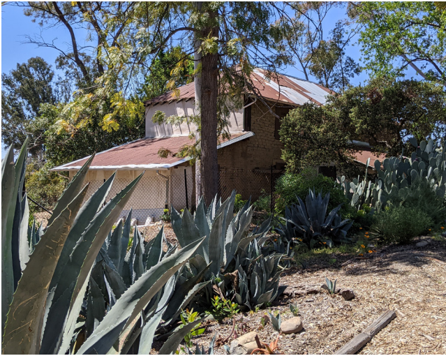
The La Loma Adobe today.

“La Loma de la Nopalera Adobe” (La Loma Adobe) anchors the southern gateway to the 800-acre Reservoir Canyon Natural Reserve. At present, this little-known structure is awaiting restoration to its former status, with only the exterior available for viewing. A prime example of an early California adobe, the La Loma Adobe is significant for its “Monterey style” design and rare two-story configuration. Its ties to the early settlement of San Luis Obispo and its association with a prominent “Californio” family adds enrichment to the story of San Luis Obispo.