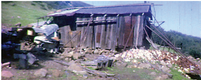
Francis “Frank” Hastings Cabin