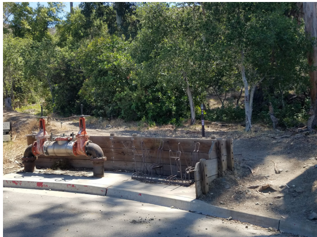
Trail head to right of bike rack and red water pipes.

Intrepid hikers can proceed over the ridge 4½ miles to Site 5, the Reservoir Canyon Dam – that’s the northern trailhead of the RCNR, accessible from Reservoir Canyon Road off Highway 101. Abundant hiking opportunities are available there, and it is easier to reach Sites 3 and 4 on the ridge that lies between the trailheads.