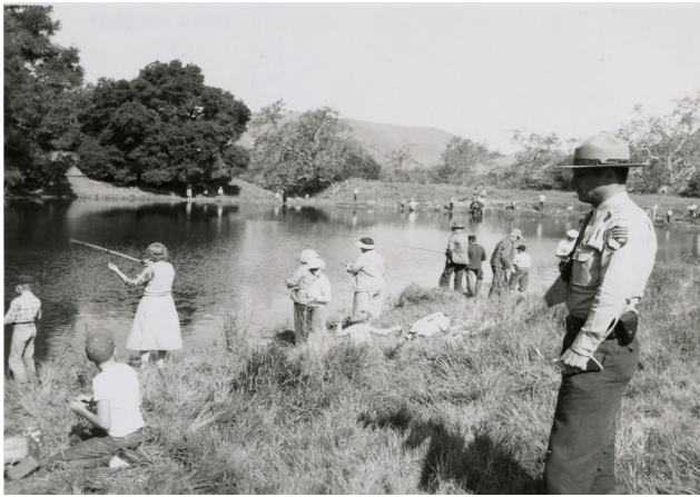
The Reservoir on opening day of fishing season, ca 1950s

major changes came to the Canyon. The Las Pilitas Fire that year destroyed much of the vegetation in the canyon, filling in the then-abandoned reservoir in the process.