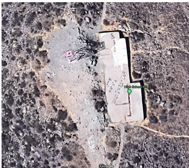
Aerial photo of abandoned tower site, 2021.