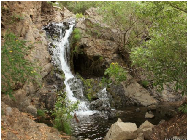
Seasonal waterfall and tunnel used to discharge water from the reservoir

The reservoir continued to serve as a recreation area, however, and the opening of trout season brought scores of anglers to its shore. Camping and picnic sites were maintained for many years by the Kiwanis Club, but in 1985, ma-