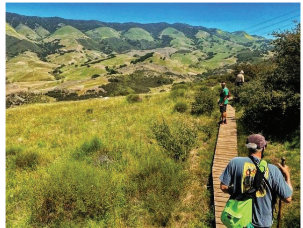
Along the trail.

Aside from its human history, Reservoir Canyon is a place of exceptional beauty and abundant biodiversity: Trails that line both sides of the canyon upstream of the dam lead along a rich riparian ecosystem, and as they ascend from the canyon, the trails reveal spectacular views from the ridge that rises above the canyon overlooking the City of San Luis Obispo and its surroundings.