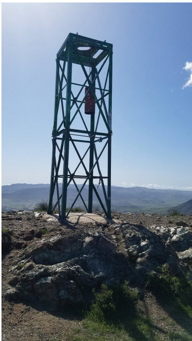
Abandoned Radio Tower.

The tall steel tower on the Northwestern spur of this ridge is shrouded in mystery. In the Conservation Plan for this area (adopted by the City in 2013), the tower is described as: “...an old air traffic beacon still stands at the Northernmost point of the trail on the ridge—a physical reminder of the World War II era...”