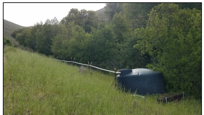
Riparian stream corridor above La Loma Adobe with modern storage tank.

The trail crosses the stream twice more before climbing steeply up the ridge. At the third crossing, note the dark green water tank and modern plumbing along the stream. These facilities were installed with the Bowden Ranch development, and the resulting spring water is utilized to supplement available municipal water in use by the homeowners in the Bowden Ranch neighborhood.